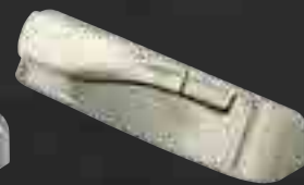
3 Satin Nickel