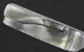
2 Antique Chrome